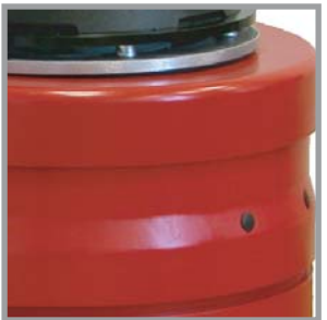
Compression cast composite housing is modular and extremely durable.