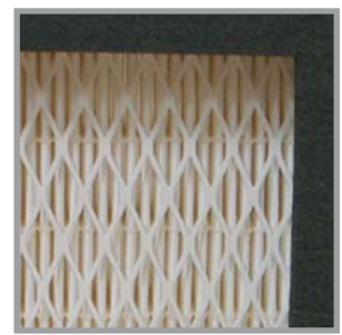
WNS vacuums are HEPA-ready should your application require absolute filtration.