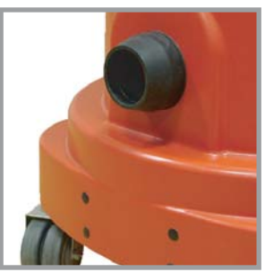
Low inlet will not let the vacuum tip over, no matter what the application.