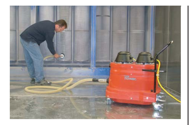
Expertly engineered with reliability and performance in mind.

Innovatively engineered, our modular housing is beyond durable. The compression cast composite fiberglass housing will never dent or rust, allowing for maximum longevity.