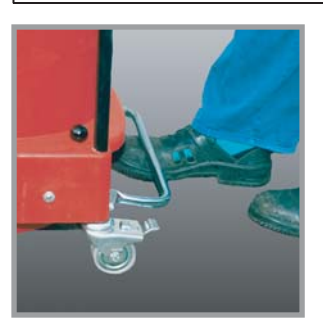
Foot-lever actuated dustpan is ideal for dust-free emptying.