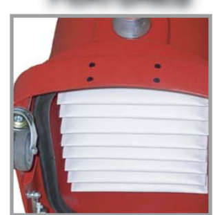
Our oversized filter allows large quanities of material to be filtered without loss of vacuum power.