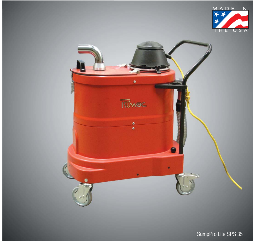
SumpPro Lite SPS 35