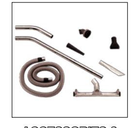
ACCESSORIES & TOOLS

Upgrades to HEPA filtration at any time to collect and contain debris down to and including 0.3 Microns.