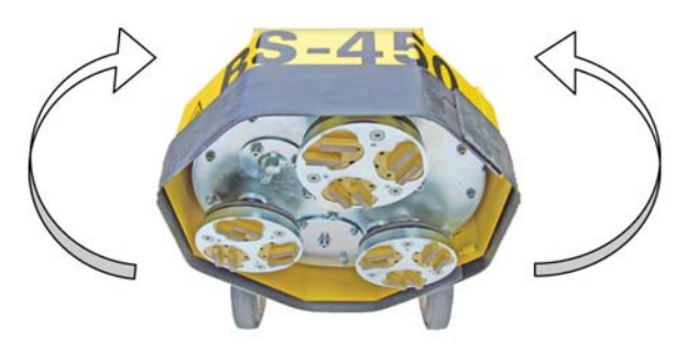
Planetary three heads technology Vaccum connections