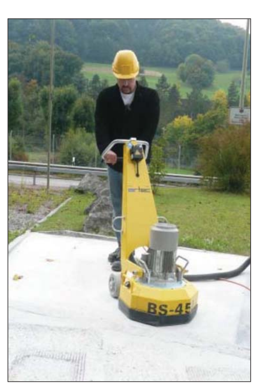
Handy Size! Great for residential jobs and small sized projects.