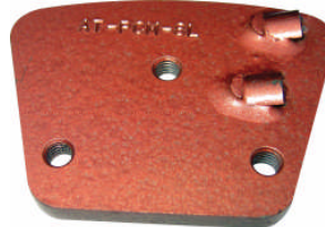
AT-CA-PCM-8R/8L 2 PCM segments for very aggressive grinding. Removal of heavy coatings and adhesives.

Resin Pads up to 3000 Grit also available!