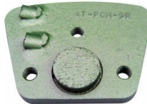
AT-PCM-9R/9L For removing coatings. After the aggressive removal fine grinding bits smooth the surface.