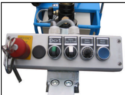
Hydraulically Controlled Adjustable Handle / Control Panel