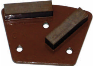
AT-CA-6 (6 grit) Removing and grinding of coatings and paints. Excellent surface preparation for paint applications