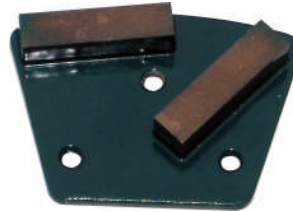
AT-CA-150 (150 grit) For polishing surfaces. For dry application on concrete.