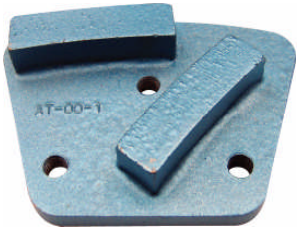
AT-00-1 (7/8 and 16/18 grit) Metal bonded diamond tool with two grinding segments.