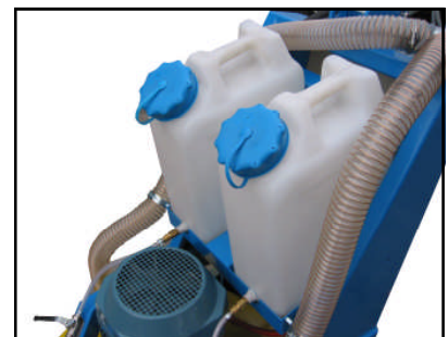
2 - 25ltr. Water Tanks for Wet Grinding

Latta Equipment • 330 E. Hebron St Ste J • Charlotte, NC • 28273 Phone: (704)752-7944 • Fax: (704)414-6811 • www.WorkDustFree.com