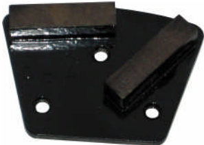
AT-CA-40 (40 grit) A segment to start concrete polishing. Also fine grinding