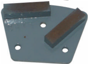
AT-CA-16 (16 grit) Removing coatings of 20 mils and less. Leveling and fine grinding after shot blasting. Leaving behind a smooth surface.