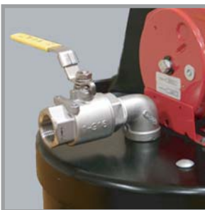
Stainless steel ball valve allows you to regulate vacuum suction.