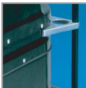
Compression cast composite housing is modular to accommodate additional filters.