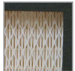
All models are HEPA - ready, should your application require absolute filtration.