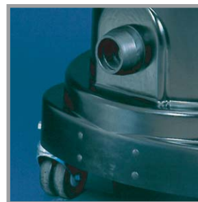
Low inlet inhibits machine from tipping over during use.