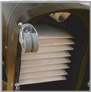
State of the art filtration system cleans effectively and efficiently.