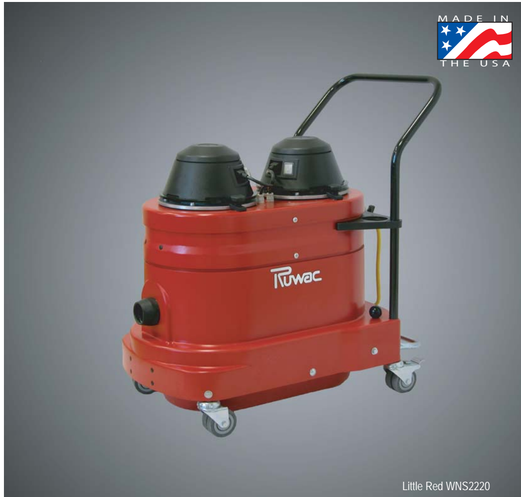
Little Red WNS2220