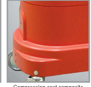
Compression cast composite housing is extremely durable and dent, corrosion and rust resistant.