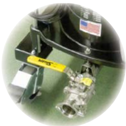
Sanitary discharge ball valve for easy emptying of liquids and materials

1.5" x 10' static conductive, urethane hose w/molded carbon impregnated cuffs; 54" aluminum shaft wand; 11" aluminum crevice tool, 3" round brush w/nylon bristles; 14", metal floor brush w/anti-static bristles, 2" x 1.5" reducer.