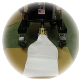
5 micron discharge filter assembly safely collects chips and sludge