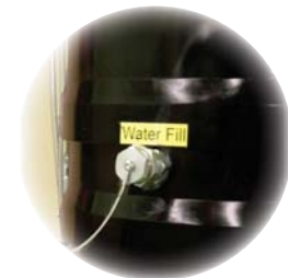
Water fill connection backflushes dispersion screen

Classified explosion proof motors and switch gear are available for electric machines and can be presented after a detailed analysis of your application by a certified Ruwac applications engineer. The air powered systems are intrinsically safe and are suitable for all explosion proof environments.